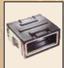
Hardigg Pro Rack