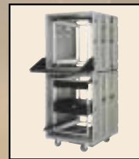
Hardigg Double Entry