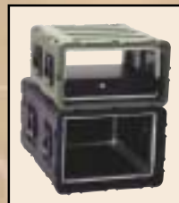
Hardigg MAC Rack