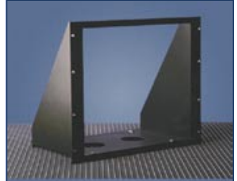
Large monitor mount