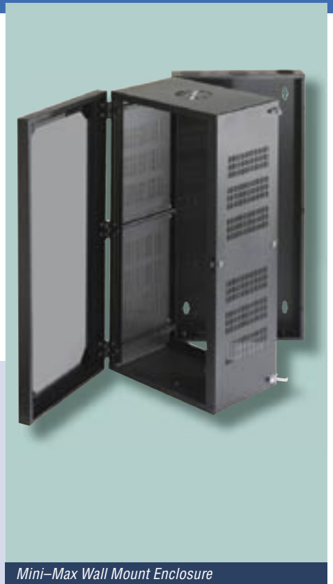
Mini-Max Wall Mount Enclosure