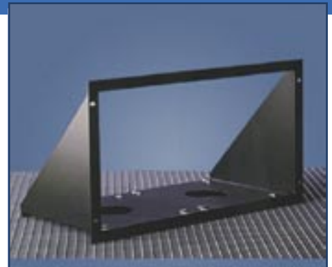
Dual 9" monitor mount