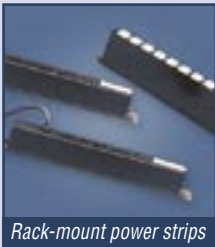
Rack-mount power strips