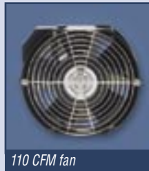
110 CFM fan