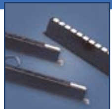
Rack-mount power strips